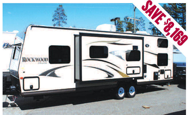
New 2013 Rockwood Travel Trailer 2909 SS Double power awning, slideout, outdoor kitchen,

power tongue jack. SUGG. PRICE: $30.164 YOU SAVE: $8.169