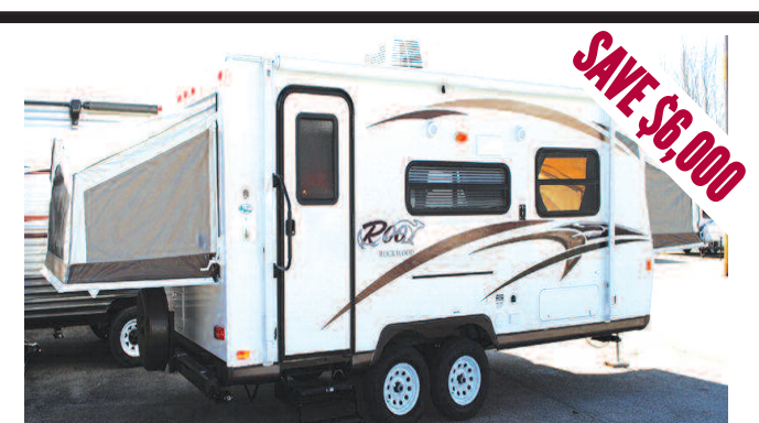
New 2015 Rockwood Lite Weight Travel Trailer RLT 19 ROO Roof A/C, outside grill, heated mattresses, power tongue jack.

Sale $1,195 PAYMENTS AS LOW AS $69 A MONTH