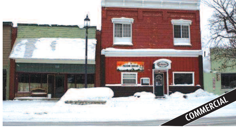
113-115 MAIN STREET, EAST JORDAN • $329,000

This bar/restaurant is a turnkey operation. These are 2 separate building that have been combined. One building has been opened up with seating with additional bathroom, for mini bar, dancing, karaoke etc. Both buildings have many updates with great sales numbers. Also 3 finished apartments above. One with large living area overlooking Lake Charlevoix. One bedroom and studio facing Main St. Liquor licensed covers the building, bar and the deck that was added in the spring of '13. MLS 439379. Ask for Mike Stark