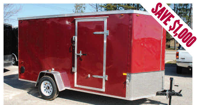
New 2014 Interstate 1 Wedge Nose 6x12 Cargo Trailers SFC612SAFS Wedge Nose Cargo Trailer by Interstate 1, Rear Ramp Door, Front Diamond Plate, 14" Platform Height, Spring Axle & Much More.