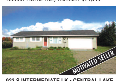
923 S INTERMEDIATE LK. • CENTRAL LAKE Squeaky clean home with a spacious back yard! 2-car garage. A short walk to allsports Intermediate Lake public access!!! MLS 438787. Ask for Mike Stark. $79,900