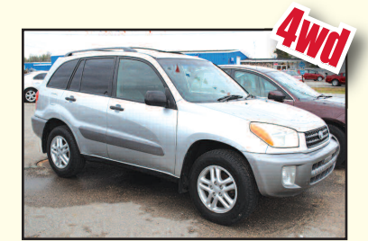
2002 TOYOTA RAV 4 4WD, nice! $199 A MONTH OR LESS