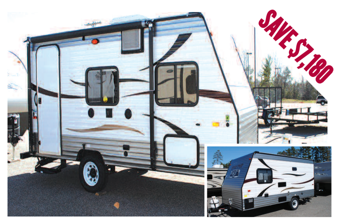
New 2014 Cherokee Wolf Pup Travel Trailer 16FB Awning, one piece walkable decked roof, safety package, stabilizer jacks.