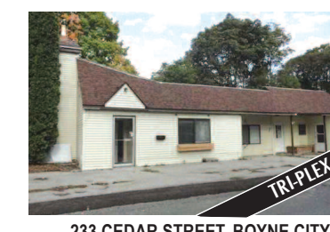
233 CEDAR STREET, BOYNE CITY Tri-plex with excellent rental history. All three units have had many updates making them attractive rentals. There is a 3 2 BA, and two, 2BR, 1BA. 435092. Ask for Jennifer Burr. $115,900

Newly remodeled ranch style home in the quaint Village of Central Lake. Relax on your front porch and view the creek running through your front yard with views also from the living room and master bedroom. Basement has finished bedroom, family room, bathroom and a nice size work shop. Garage is over sized with a bonus room inside, plus room for all your toys. Walking distance to down town and park with Hanley Lake close by.MLS 439266. Ask for Holly Nierman