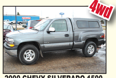
2000 CHEVY SILVERADO 1500 4x4, step side, Leer fiberglass topper, tow pkg. $199 A MONTH OR LESS