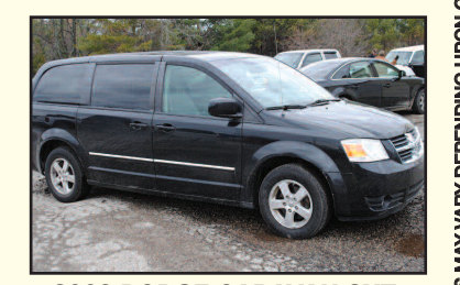
2008 DODGE CARAVAN SXT Stow-N-Go, seats 7. $175 A MONTH OR LESS