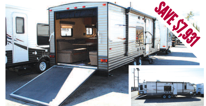
New 2015 Cherokee Grey Wolf Travel Trailer 26RR. Toy Hauler, power awning, power tongue jack.

SUGG. PRICE: $26,926 Sale $ YOU SAVE: $7,931