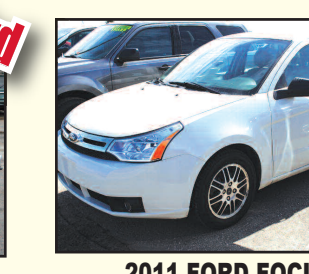
2011 FORD FOCUS 35 MPG. Looks and drives like new. $189 A MONTH OR LESS