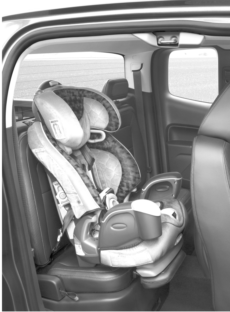
The 2015 GMC Canyon with segment safety firsts including a patent-pending child safety feature. Utilizing the rear jump seat headrest on the passenger side of the extended cab Canyon, the base of the jump seat can be extended to meet NHTSA's recommendation by removing the headrest and inserting it horizontally.

In addition to this patent-pending design, the all-new Canyon will be the first midsize truck to offer Forward Collision Alert and Lane Departure Warning technology as part of the available Driver Alert Package. Forward collision alert technology helps prevent frontal crashes by alerting the driver when the truck is closing in on a vehicle ahead too quickly, giving the driver additional time to react