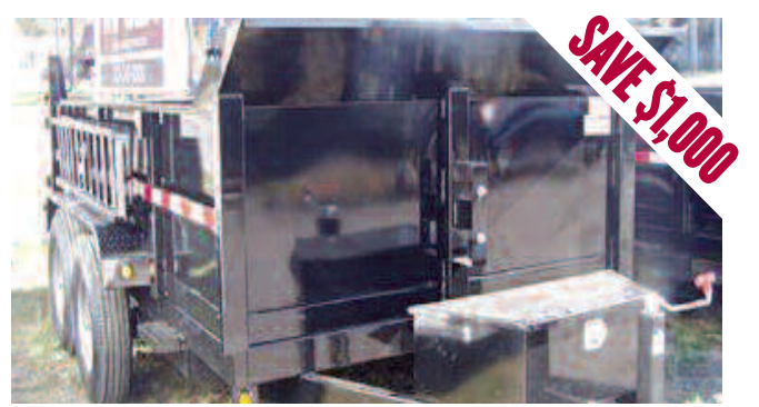
New 2014 Interstate 1 6.5' x 12' Dump Trailer, Griffin 68x12 Tandem Axle Heavy Duty Dump Trailer. Twin Cylinder, Powder Coated, 2 Way Gate, Heavy Duty Ramps, Monarch Pump, Interstate Battery, D Rings, Load Tarp, Much