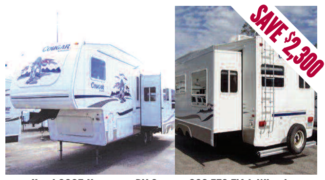
Used 2005 Keystone RV Cougar 286 EFS Fifth Wheel Double Slide, Rear Kitchen Slide, Sleeps 6, Queen Bed, Sofa Bed/Dinette, Chair, Refer, Range, Micro, Neo Angle Shower and much more!