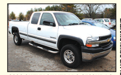
2001 CHEVY SILVERADO 2500HD LS 3/4 ton, long bed, 90 K. SALE PRICE $7,995