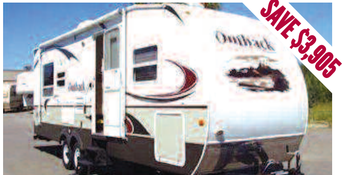
Used 2009 Keystone RV Outback Sydney Edition 29RLS Travel Trailer

Single Slide Outback Sydney TT (stock only) w/Rear Living Area, Two Lounge Chairs, Corner Entertainment Center, Sofa & Booth Dinette Slide, Dbl. Kitchen Sink, 3 Burner Range Refrig., Opt. Outside Camp Kitchen, Side Aisle Bath w/Angle Shower, Lavatory, Front Queen Bed w/Dbl. Wardrobes, TV Shelf, Overhead Cabinets Throughout & More