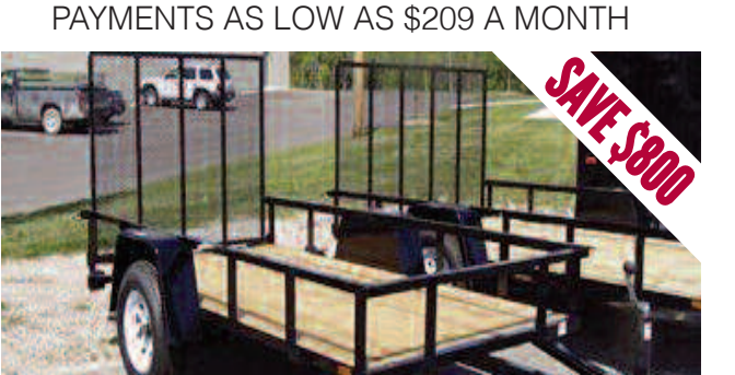
New 2014 Forest River RV Open Steel Angle Iron Trailer USASG510SA Open Steel Angle Iron Trailer by Forest River, 5x8 Single Axle w/Gate, 3500 LB Axle, Treated Deck, Fold Flat Rear Gate, DOT Approved Lights, Triple Angle Tongue & Much

power tongue jack. SUGG. PRICE: $30.164 YOU SAVE: $8.169